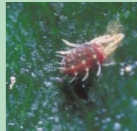
Red mite ( Panonychus sp.)