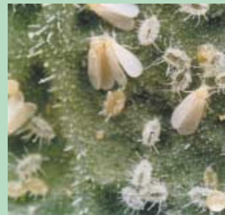
Greenhouse whitefly ( Trialeurodes vaporariorum )