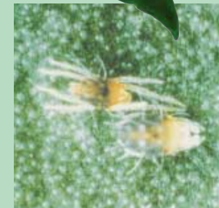
Spider mite ( Tetranychus sp.)