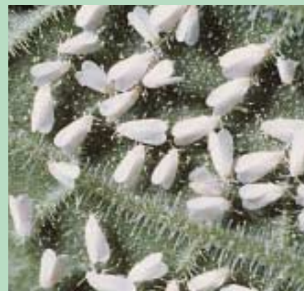
Cotton whitefly ( Bemisia tabaci )