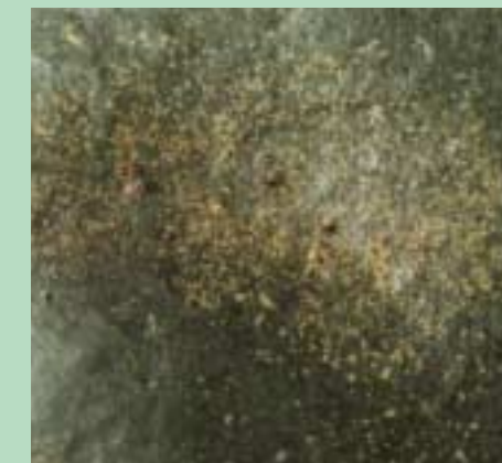
Red coffee mite ( Oligonychus coffeae )